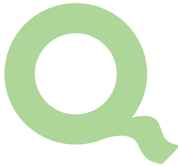
Pantone 361 at 50%